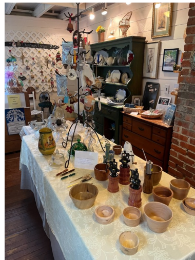
FOC Gift Shop