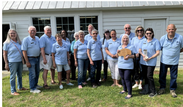
Friends of Chippokes Members -circa 2025