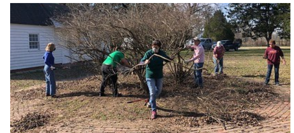
Garden Workday Volunteers